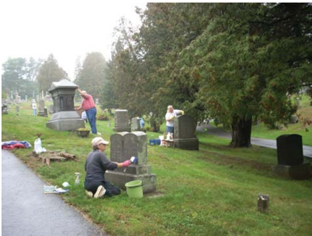
Friends of Town of Bedford Cemeteries cleaning grave stones.

We have many new and interesting projects planned for the upcoming year and your membership fee will assist in making those plans a reality. We are a 501 (c) (3) charity so your contributions are tax deductible. Membership is only $10 per year for an entire family. We also have a "Restorer" class of membership: just add $15 to your family membership for a total of $25. We plan a private and interesting cemetery tour for our Restorer members!